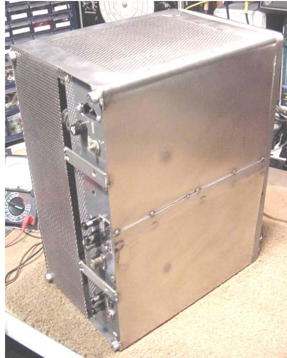
Above: underneath view before powder coating. Below: completed case test-fitted to the (working) chassis prior to powder coating.

The resulting construction is by no means a 'perfect replica' of the original but it meets my needs – I don't see the point in paying more for a replica case than the radio is worth – and in my opinion the case as described and constructed above serves the purpose of protecting the receiver, the operator and generally looks the part at least from the front, top and sides (which is what folks see most of the time). The total cost was about $22 (Canadian) for the steel, $3 for the brackets and $50 for the powder coat (the latter was a