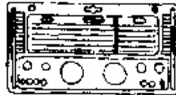
Case "D" Die-cast aluminium Eg 680X, 730, 770R/U, 840, 868A