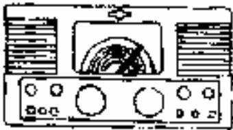
Case "C" Die-cast aluminium Eg 504, 640, 670, 680, 740