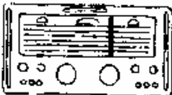
Case "E" Pressed steel Eg 840C, 850/2, 940